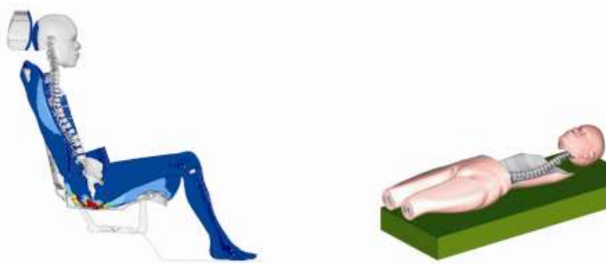
Figure 3: Abaqus FEA analysis of seated (a) human figure and recumbent (b) BOSS MODEL are used by the Center for Biomedical Engineering at Frankfurt University as part of an ongoing program to develop a research methodology that can be applied to products interacting with any part of the human body.

More information: simulia.in.info@3ds.com ; www.edstechnologies.com