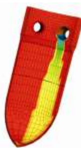
Figure 2: Cutaway view of reactor pressure vessel (RPV) at the start of a pressurized thermal shock (PTS) simulation by TÜV, using Abaqus FEA. The vessel, which normally operates at 300° C (indicated in red), is shown as cooler water (30° C) begins pouring in through the nozzle on the top right.