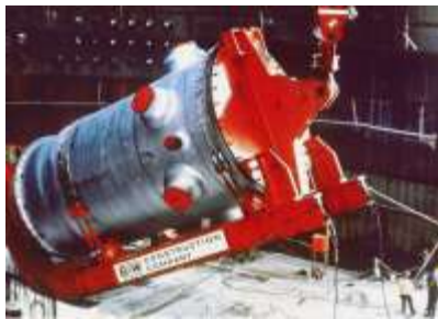
Figure 1: A nuclear reactor pressure vessel that houses the fuel rods. Exterior view of the nozzles (with red caps) through which hot and cold water circulate into and out of the vessel.

A typical FEA analysis of an RPV takes into account temperature transients, internal pressure fields, and radiation embrittlement behavior of the vessel during a simulated LOC event. The simulations examine stresses at vessel walls and entry points of the hot and cold water nozzles feeding into the RPV.