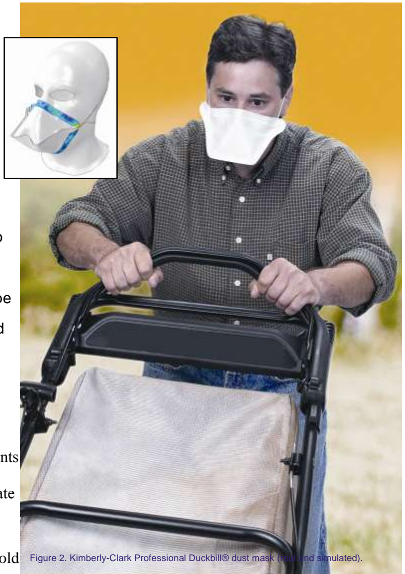
Figure 2. Kimberly-Clark Professional Duckbill® dust mask (real and simulated).